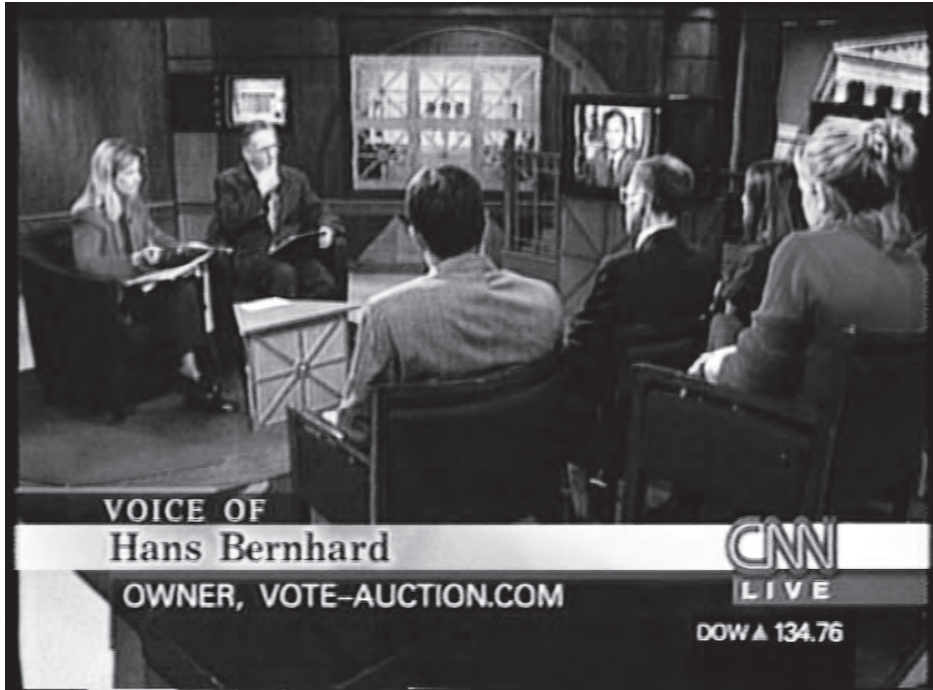
Image: UBERMORGEN - [V]ote-Auction, CNN "Burden of Proof", 2000. Video, 27:08 min http://vote-auction.net.