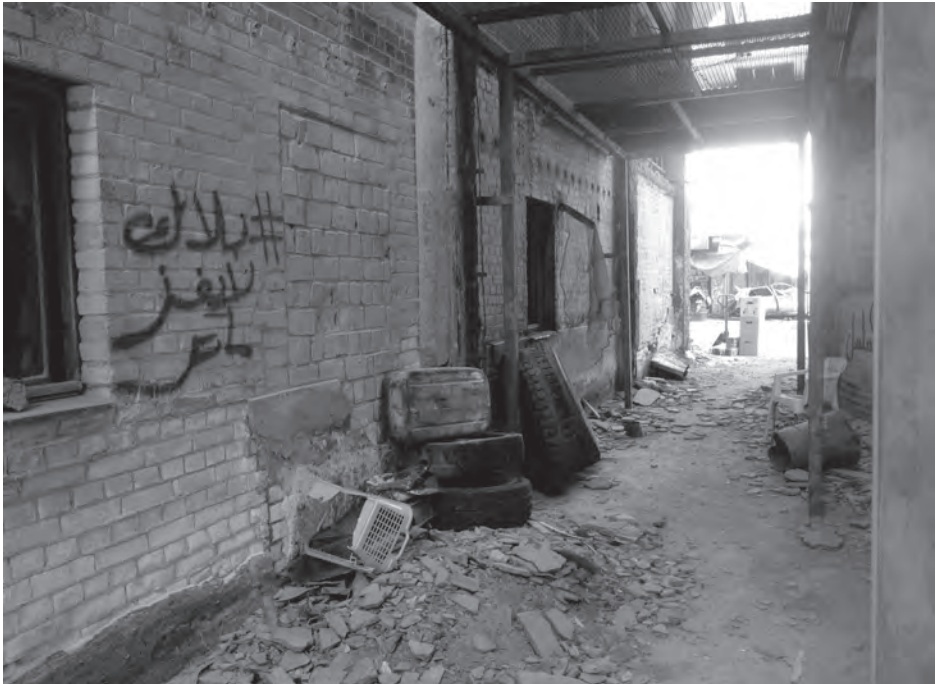
Image: Arabian Street Artists - Homeland is Not A Series (2015) Graffiti in image reads: #blacklivesmatter