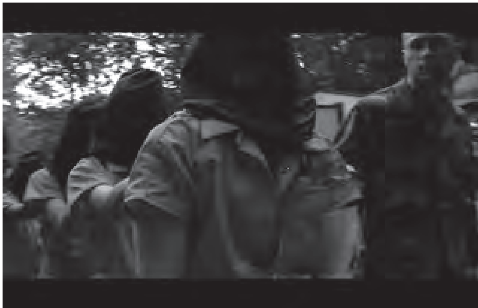
Image: Coco Fusco – Operation Atropos (2006)

Coco Fusco is an interdisciplinary artist, writer and professor born in Cuba, living and working in New York and Miami (US). In July 2005, Fusco gathered a group of female students with the aim of taking a course to learn the different techniques that can be used to extract information from captured prisoners. Retired U.S. Army interrogators subjected the group to immersive simulations of POW (prisoner of war) experiences to show them what hostile interrogations can be like and how members of the U.S. military are taught to resist them. The group of interrogators, called Team Delta, regularly offer intensive courses which they refer to as “Authentic Military Experiences” for civilians.