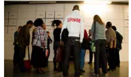
Combined exhibition visit in preparation of the meeting What did you expect to see? exposition space TENT. Rotterdam

Simulacrum , Magazine for contemporary art and culture published an interview with Fouad Laroui on the outcome of the event. April 2010, jaargang 18 #2/3