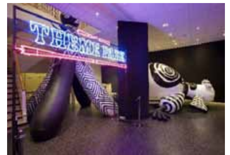
Brook Andrew, exposition Theme Park (2008/2009) in AAMU - Museum for Contemporary Aboriginal Art, Utrecht