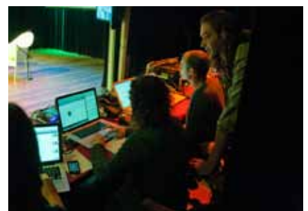
Skype conferentie Culturale Heritage & Shared Knowledge in De Balie, Amsterdam