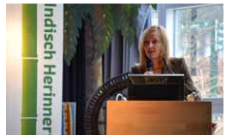
Humans rights activist Liesbeth Zegveld during Contested History draws a parallel between the representation of the Dutch colonial presence in Indonesia and the legal system for dealing with war crimes like conducted in Rawagede