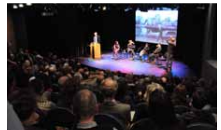
Booklaunch and panel discussion on the collection of Islamic Art at the Royal Tropical Institute, Amsterdam