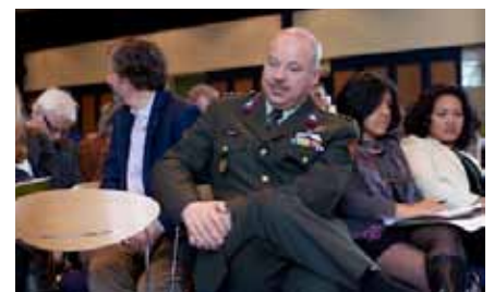
Dialogue between different stakeholders of the exposition The Story of Indië ; military history and civil history through the eyes of war veterans and the Dutch Indo community Nederland. Symposium on the representation of Dutch colonial history, in cooperation with the Dutch Indonesian Remembrance Centre