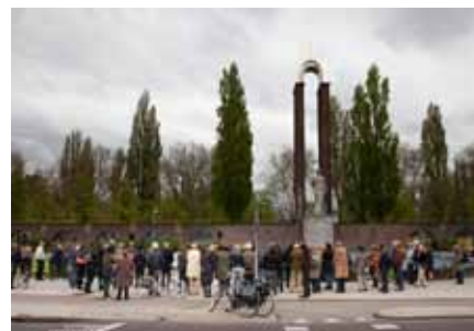
Hacking History , bijeenkomst bij Monument Indië Nederland, 5 mei 2012